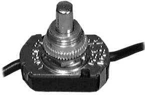
Mounting Hole: 0.375"