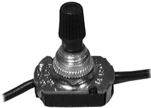
Mounting Hole: 0.375"