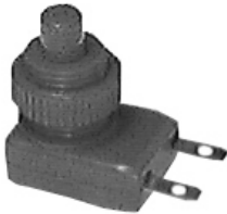
Mounting Hole: 0.400"